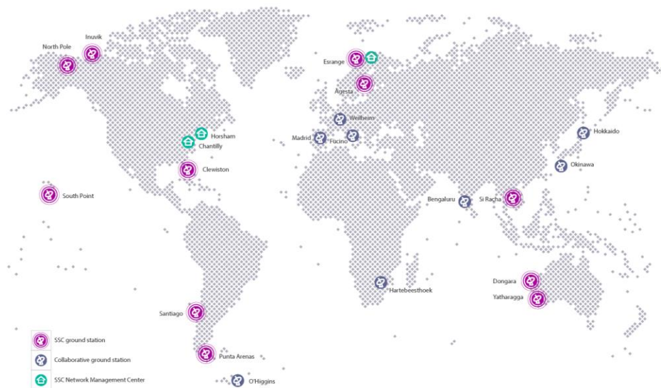
Exhibit 1: SSC Global Ground Network

The first consideration a small satellite operator may make is determining which locations are ideal for communicating with its satellite(s). SSC owns and operates 11 stations and has access to 8 collaborative stations. Locations are ideally suited to communicate with satellites in mid latitude or polar orbits. Many of our locations have multiple apertures ranging in size from 7m – 13m. In most cases the customer can manage just one connection to the SSC Network Management Center, depending on backhaul data requirements.