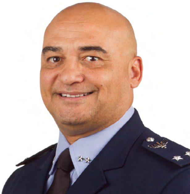
Major General José Vagner Vital

Space warfare – in the broad sense – is already happening. We’ve seen attacks on ground segments and link segments of space systems. And while there have not been any confirmed reports of attacks on the space segment – the satellites themselves – it is not mere conjecture to think that an attack could occur there at any time. Not just the destruction of a satellite, but there are other methods of attack such as laser and microwave, electromagnetic pulse and capture and orbital changes. There are countries that already possess these capabilities.