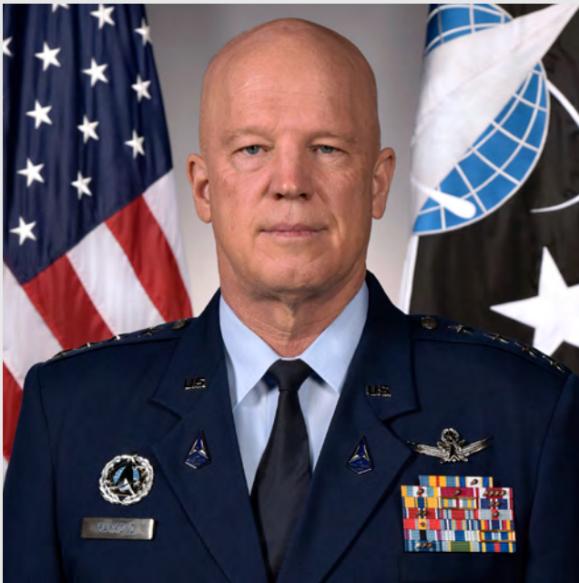
General John W. "Jay" Raymond Chief of Space Operations, US Space Force